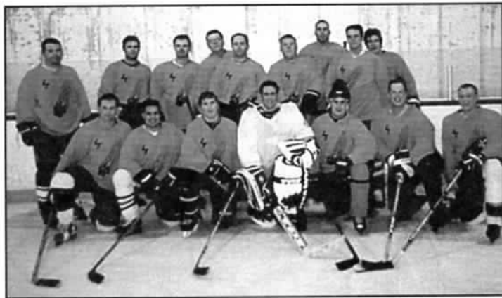
Non-competitive champs Larryville Tigers.