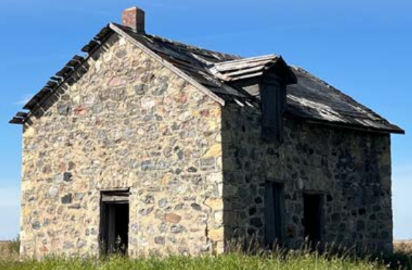
Old stone house, south of Cupar

This newsletter may find you preparing for Christmas, perhaps to spend time with family. From our family to yours, many blessings and best wishes for 2025.