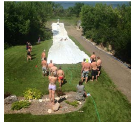
A little farmer ingenuity makes for a great water slide

... it's time to sit by the fire and reminisce about the good days when we were wild and crazy Agros, along with a lot of chirping between the northern farmers and southern farmers.