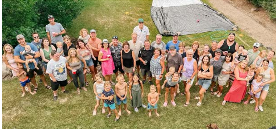
Three generations at the 2024 Reunion, Buena Vista

As you can see from the photo, we designed a 150-foot water slide that provides a ton of fun for not only the