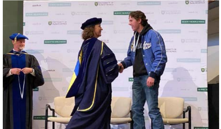
2024 Pinning ceremony

We held our second annual pinning ceremony this year – aimed at welcoming second year students to their new majors. Held in Convocation Hall, this event has just enough gravitas to feel special (I even bust out my regalia, which only ever gets worn for convocation ceremonies otherwise) but is also small enough to be a bit more informal. I try not to go too far off-script, but I just can't help myself sometimes. Students each receive a custom AgBio pin attached to a ribbon that corresponds to the color of their convocation hood, get a practice run at crossing a stage and shaking the dean's hand, and afterwards have an opportunity to mingle with the college executive and faculty. It's a new tradition that we look forward to continuing for years to come!